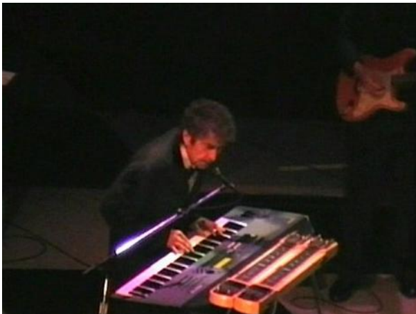
Two from Shepherd's Bush Empire