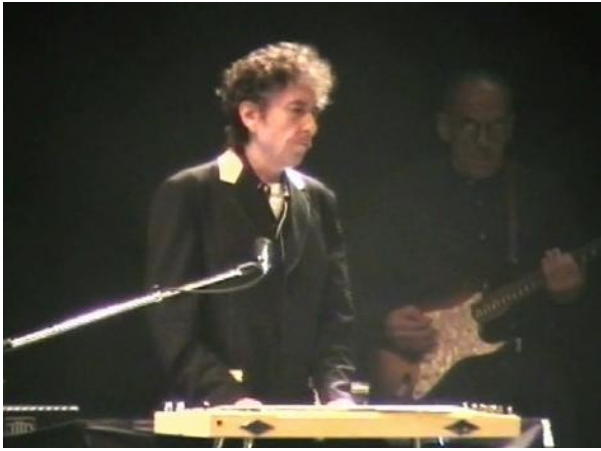
Two from Sheffield Arena

STARS D291 is certainly worth having, which makes it four. But for similar material more enjoyably presented (not to mention an astonishingly fine audio Jokerman thrown in for good measure) seek out D280.sse .