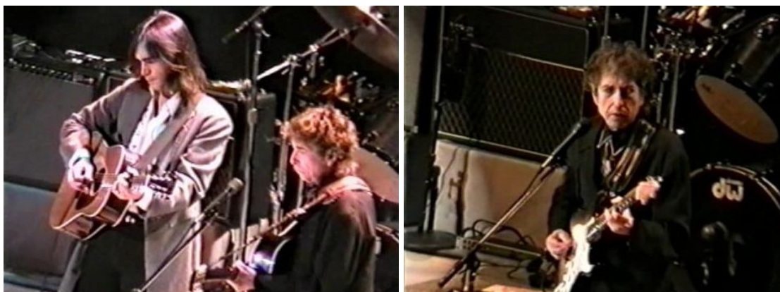
IMAGE See screenshots below. Rock-steady, wholly unobstructed right-side balcony film, a bit dulled by repeat copying but still consistently good. Plenty of D + Larry (though nothing very close) and plenty, too, of the whole band. Camerawork of a high standard.

RUNNING TIME 121 minutes - complete gig.