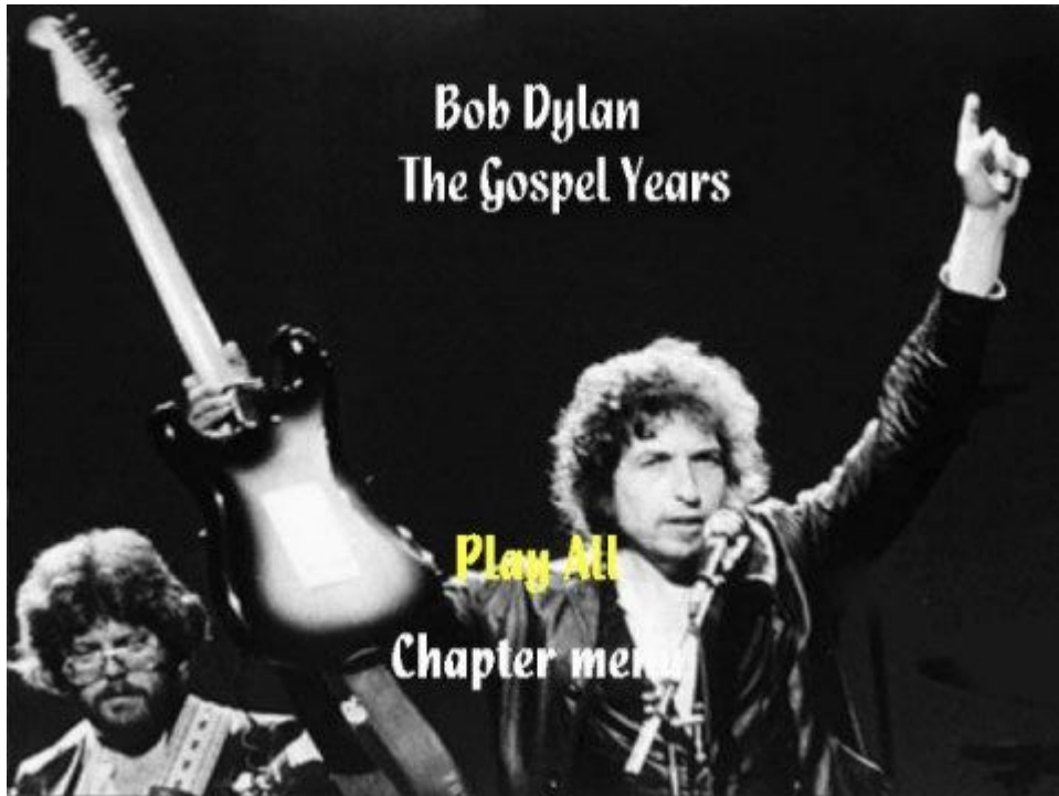
D187 menu screen

belief, burning with divine fiery zeal. You don't have to buy into his (arguably dubious) philosophy to enjoy these performances, but be warned - his passion and commitment are infectious! Don't believe me? Check out the faces - sold every one - of the audience-members down by his feet.