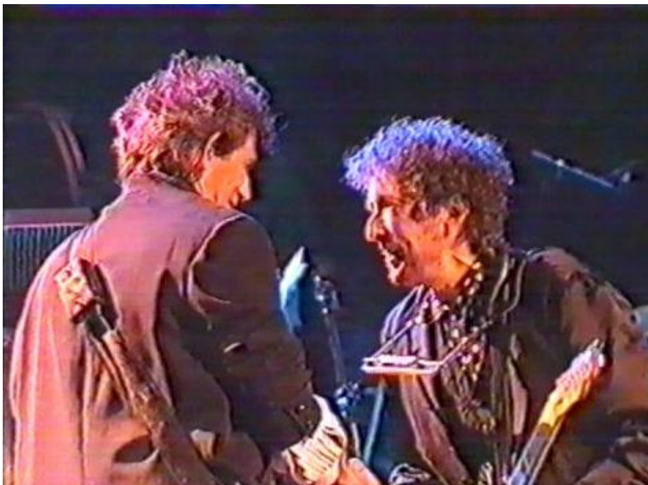
... .. and now ...