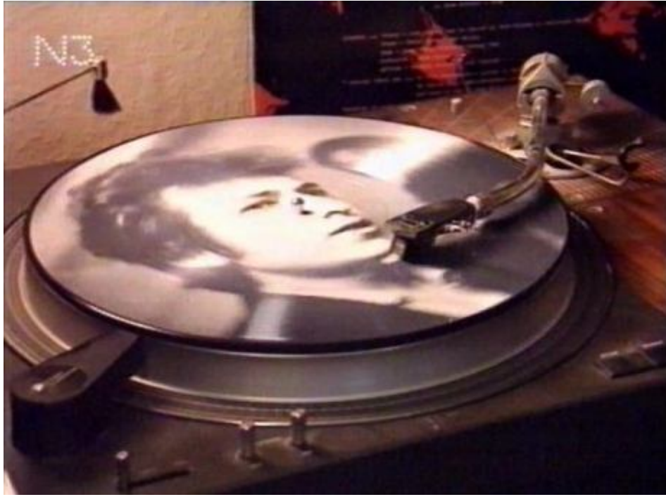
It used to be like that ...

a rabbit in headlights - I was hoping he'd try the Spanish verse, but no), an unconvincing Answer Me then on comes Keith and you can't help but recall the last time (D013, fifth chapter) they appeared on TV together ... And, yes, what follows is indeed every bit as bad. D's lines in Shake, Rattle And Roll are all but unintelligible and, come the end, he can't get off the stage quick enough.