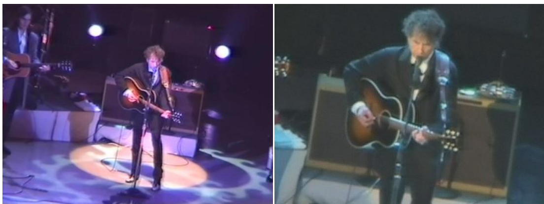
IMAGE Other than a dearth of close-ups and isolated obstructed-view problems, very good indeed.